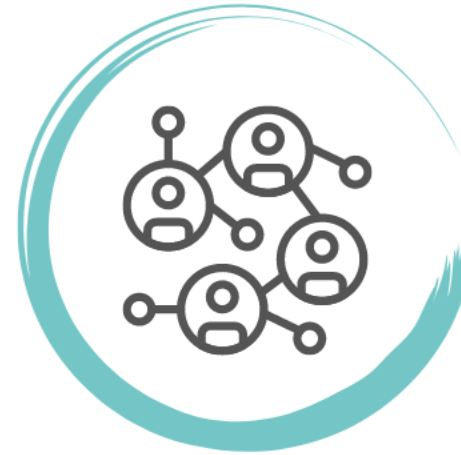
NETWORKING & INVESTOR LINKAGES