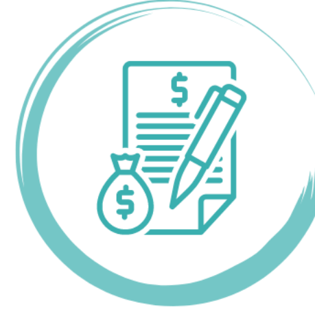
REPAYABLE GRANT FUNDING