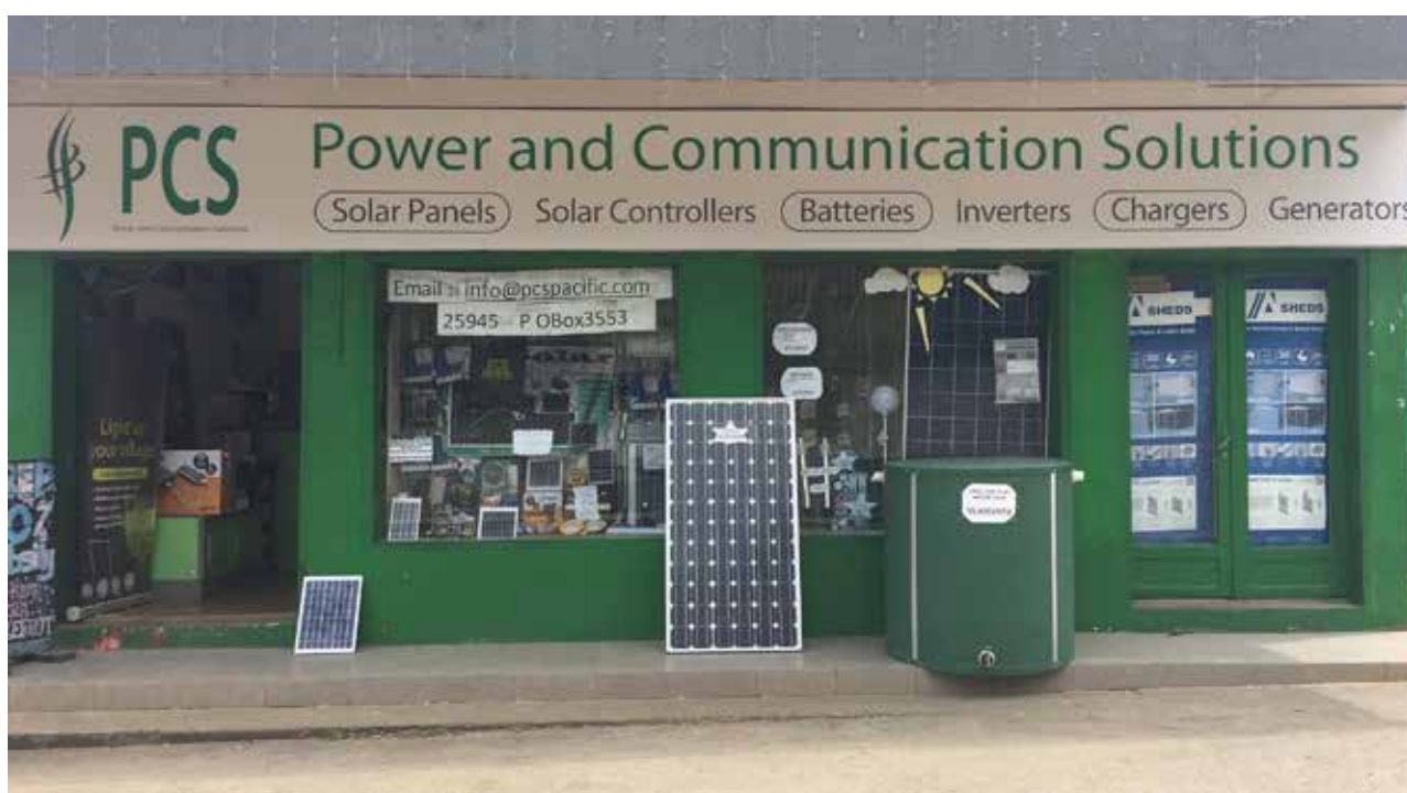
PCS's shop in Port Vila offers a variety of solar products for sale 20

PCS 19 is an alternative energy company that provides solar-powered solutions for communities, businesses, and residential customers.