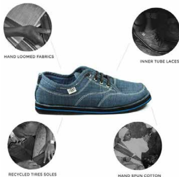
Sole Rebels manufactures shoes from recycled products and describes itself as “Green by Heritage” 28

Sole Rebels 27 is an Ethiopian company that makes shoes from recycled materials.