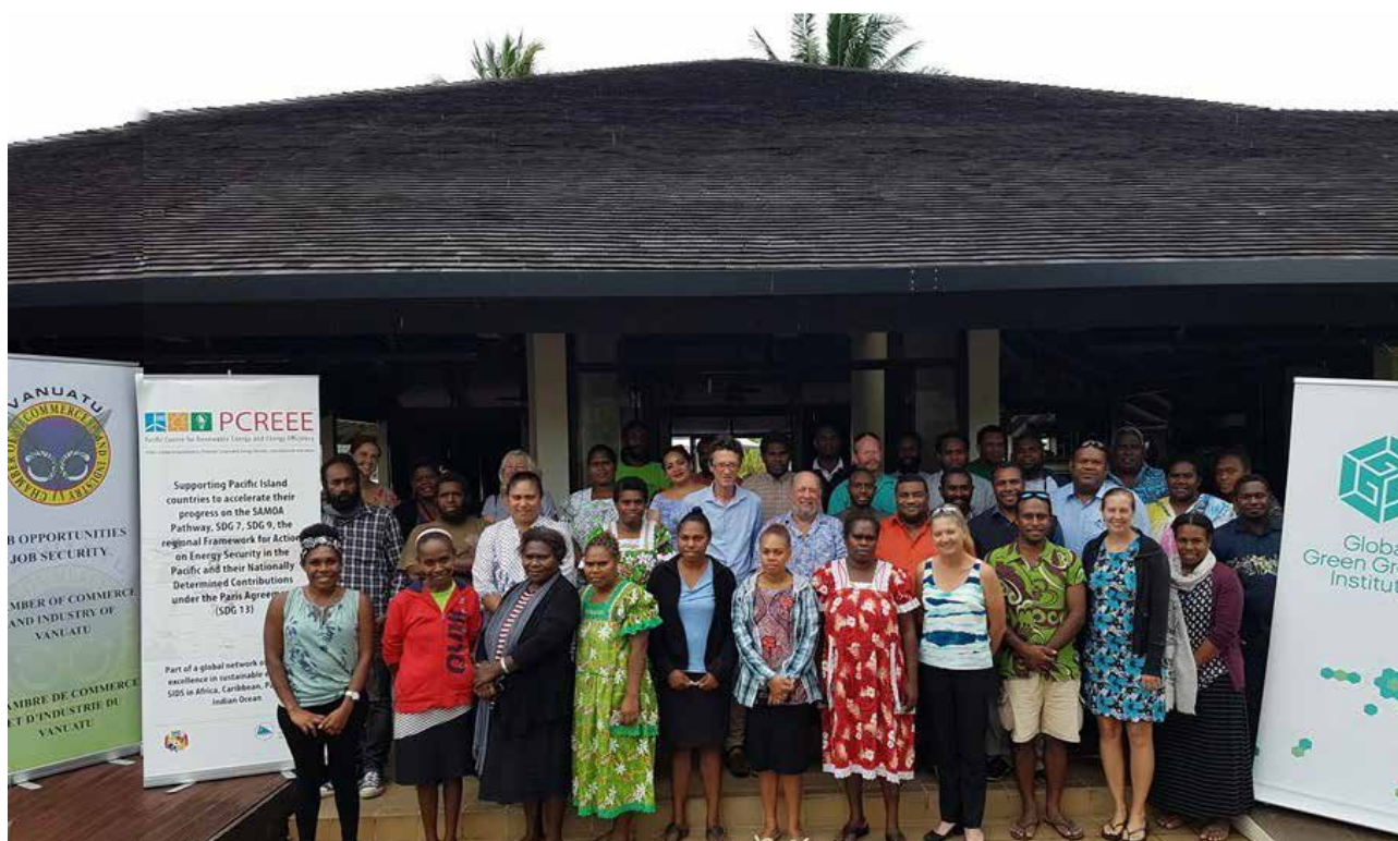
Group photo of participants at the Greenpreneurs Jumpstart your Green Business Workshop in Port Vila, September 2018

In Vanuatu, the Greenpreneurs Jumpstart Your Green Business Workshop was held in September 2018, organised jointly with the Pacific Centre of Excellence for Renewable Energy and Energy Efficiency. Over twenty participants engaged with trainers and local business mentors to learn about trends in agriculture, waste, and low-impact tourism; requirements for starting a business in the country; and examples of existing successful green businesses in Vanuatu and the Pacific region. This guide is based on the information covered in the workshop, and aims to assist other potential green entrepreneurs in developing new, innovative green business ideas that will help Vanuatu meet its environmental and developmental goals and ensure a clean, prosperous future for the country.