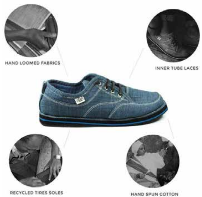
Sole Rebels manufactures shoes from recycled products and describes itself as “Green by Heritage” 33

Sole Rebels 32 is an Ethiopian company that makes shoes from recycled materials.