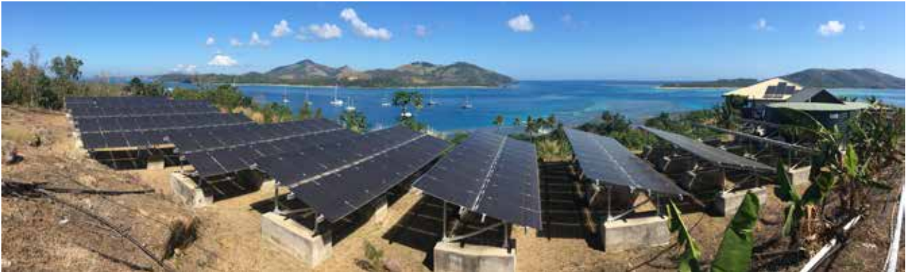
Nanuya Island Resort has a solar array of 260 panels providing electricity for their tourism property in the Yasawa Group 27