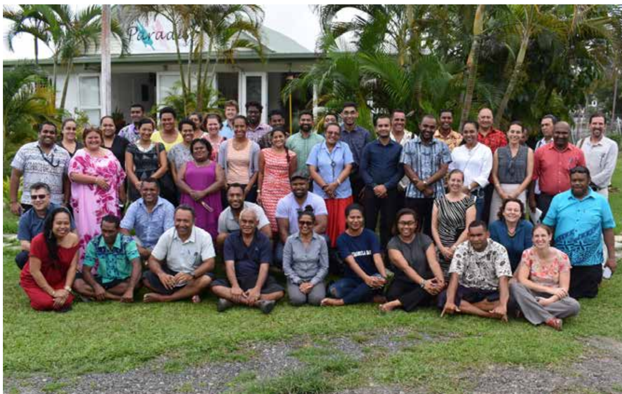
Group photo of participants at the Greenpreneurs Jumpstart your Green Business Workshop in Suva, Fiji, September 2018

This guide was reviewed and revised in March 2020, incorporating changes to company and employer obligations.