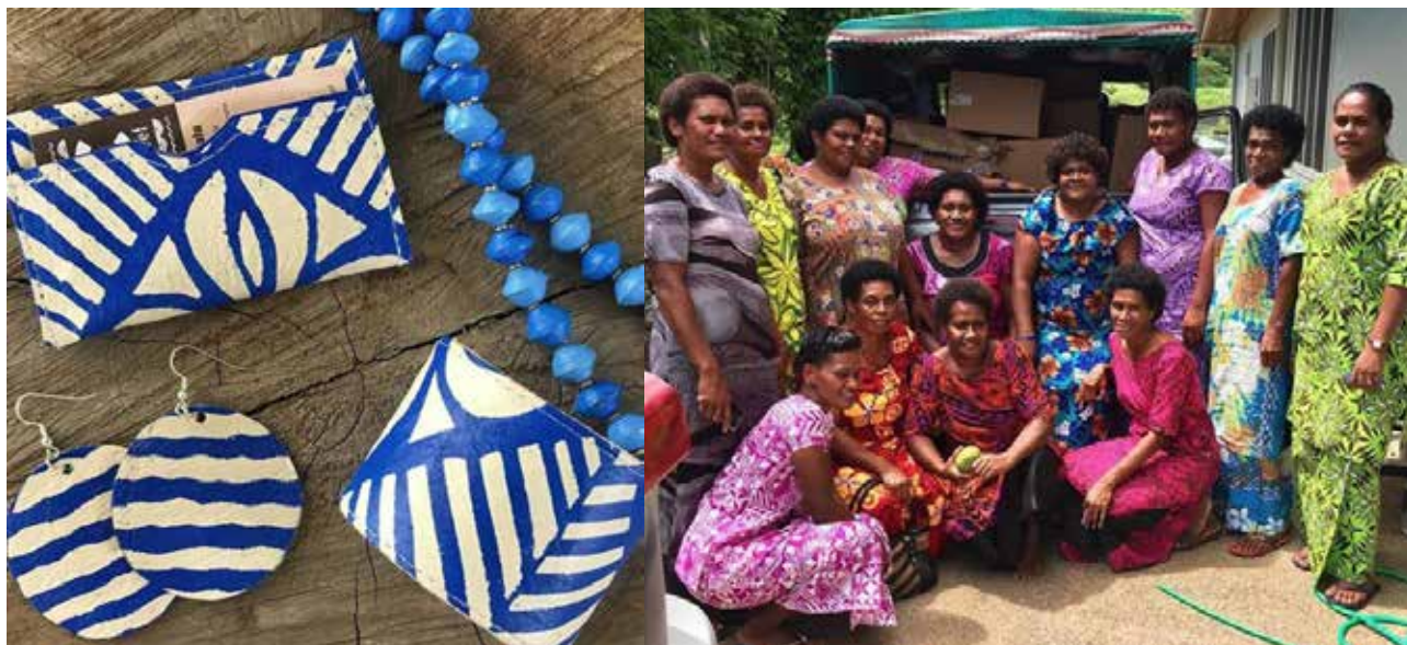
Rise Beyond the Reef products and staff 9

These motivational differences mean that the two businesses may make very different strategic decisions. For instance, if the demand for construction material changes so that crushing glass for construction products is no longer viable, Business A may consider repurposing recycled glass into other products, but Business B may decide to stop recycling and crushing glass, and look for other options to employ labourers. In this example, Business A is mainly a green business, while Business B is a social enterprise.